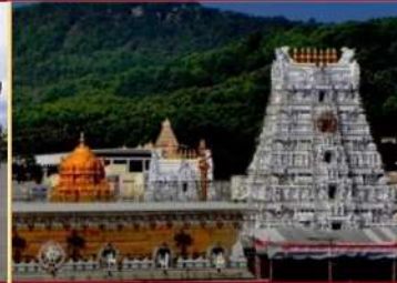
Sri Venkateswara Temple, Tirumala