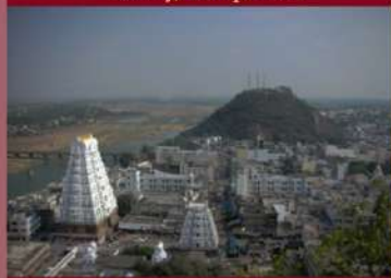
Sri Kalahasteswara Temple, Srikalahasthi