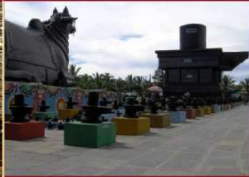
Kotilingeswara Temple, KGF