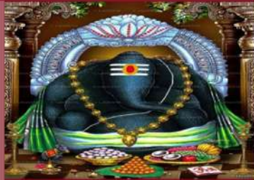
Sri Swayambhu Varasidhi Vinayaka Swamy, Kanipakam