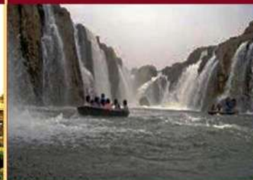
Hogenakkal Waterfalls, Tamilnadu