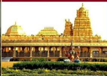
Golden Temple, Sripuram, Vellore